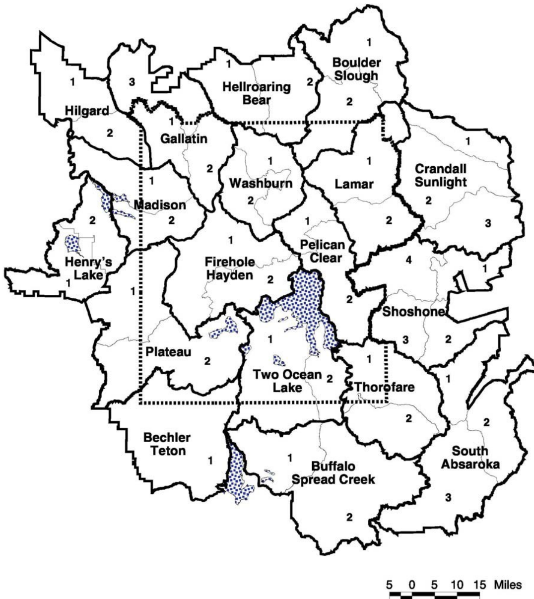
Figure 2. Yellowstone grizzly bear recovery zone boundary showing bear management unit (BMU) and subunit boundaries for application of Demographic Criterion 2.