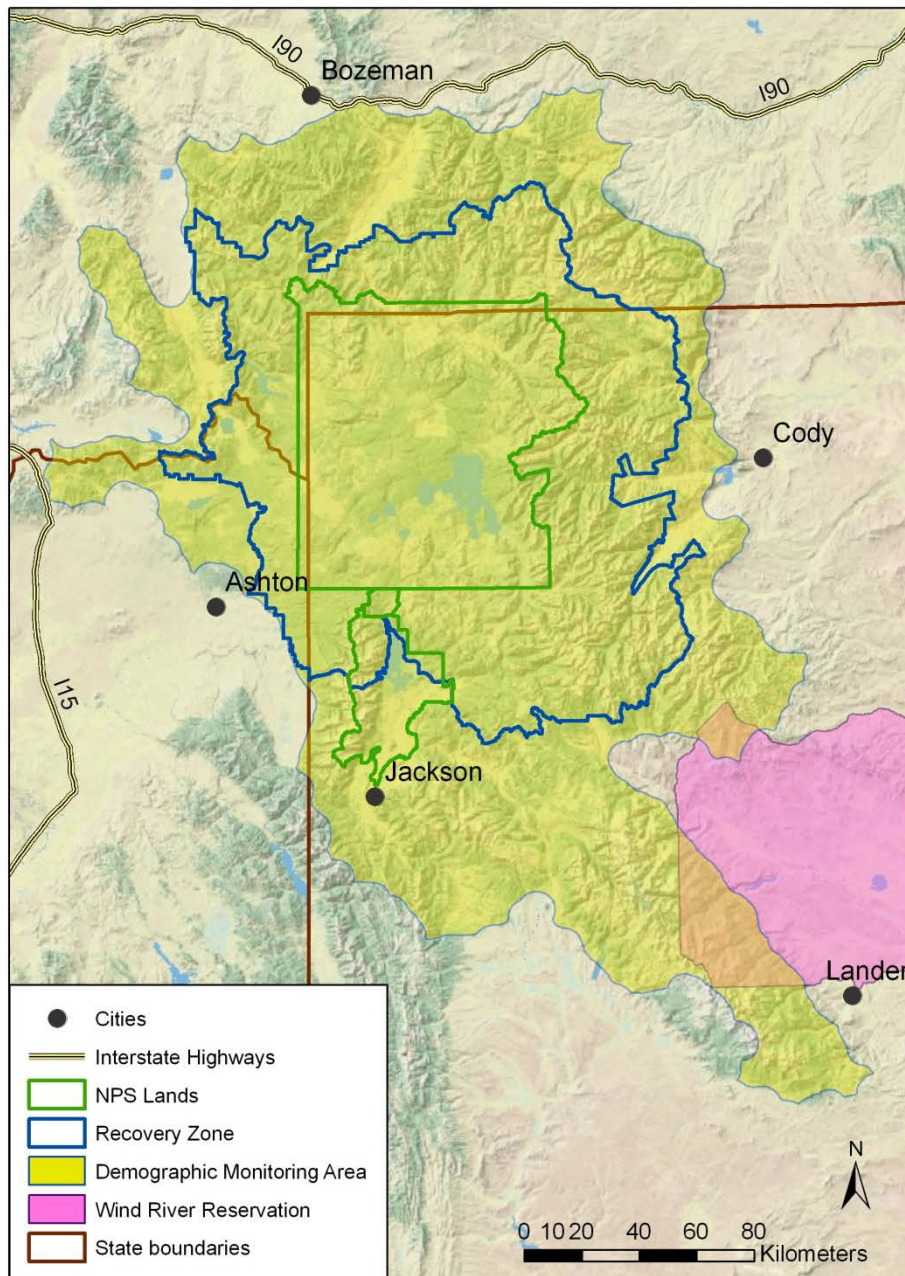
Figure 1. The Demographic Monitoring Area within which all demographic criteria would be assessed.